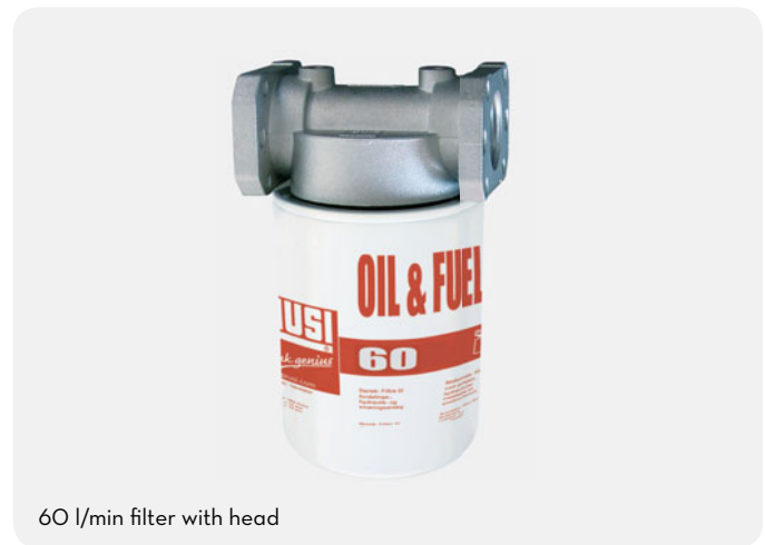
60 l/min filter with head