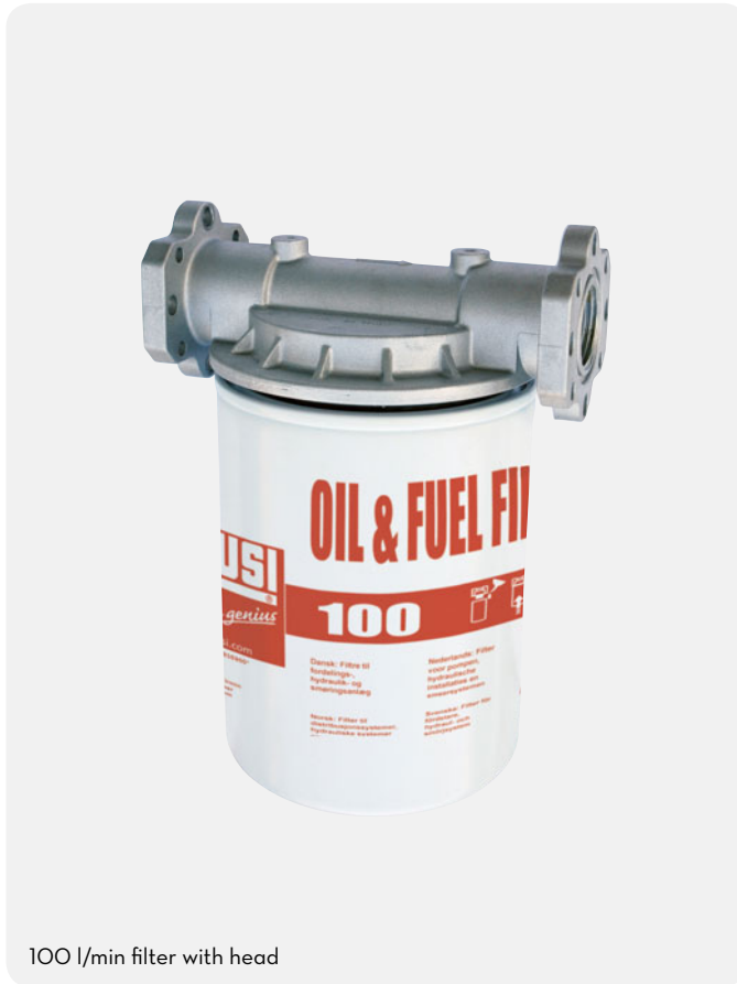
100 l/min filter with head